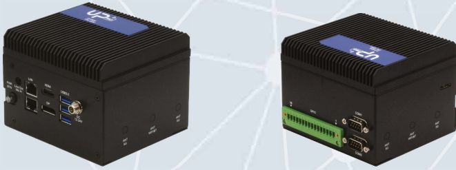
1x UP Squared Pro Edge